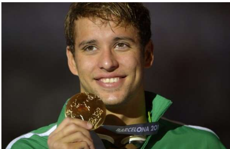
Gold medalist Chad Le Clos poses with his medal. Le Clos won the men's 200-metre butterfly swimming event in the FINA World Championships in Barcelona.